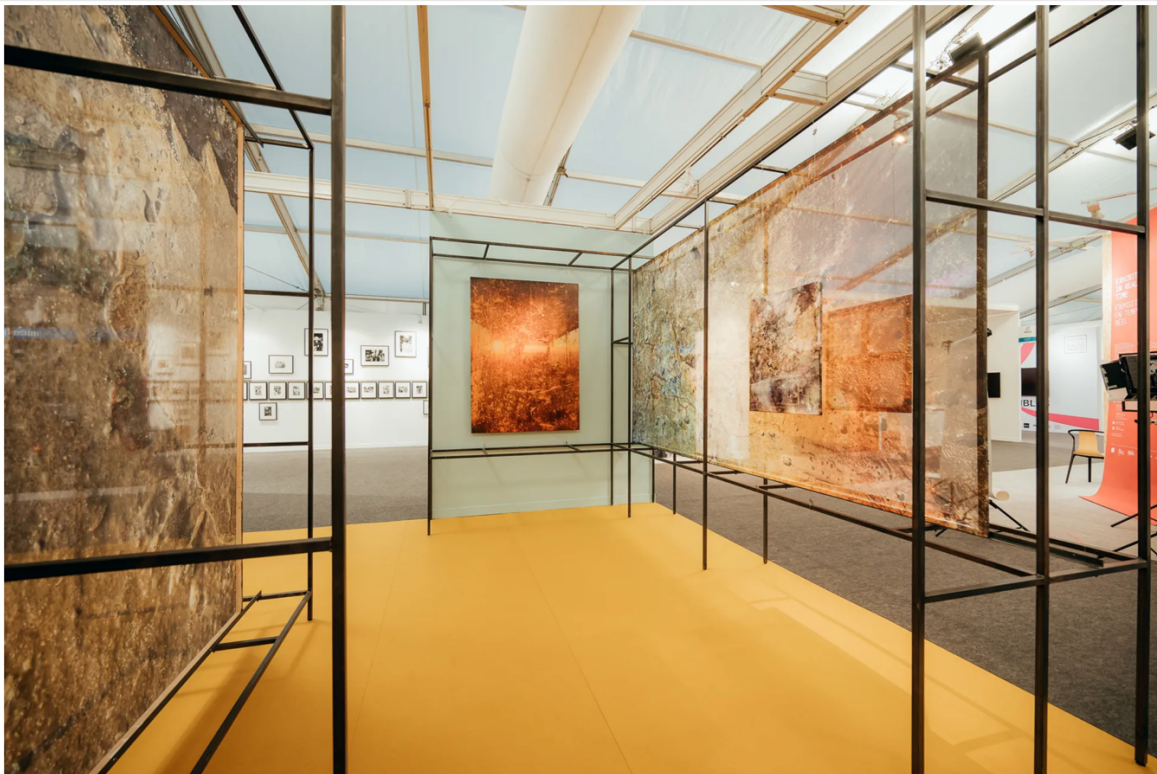
'Insolare', installation view at Paris Photo 2023